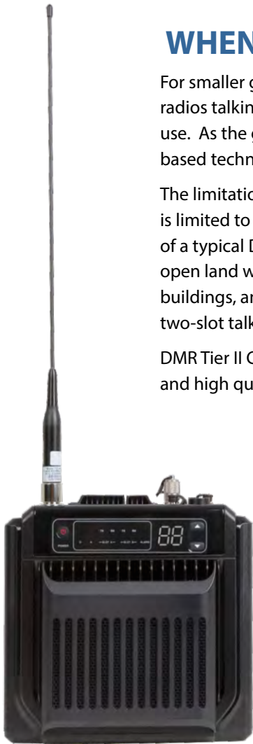
HR652 Compact Repeater

DMR Tier II Conventional Repeater systems are deployed to when the limited range, growing number of users, and high quantity of calls on radio-to-radio systems are limiting the organization's communications capacity.