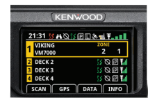
Night - High Contrast